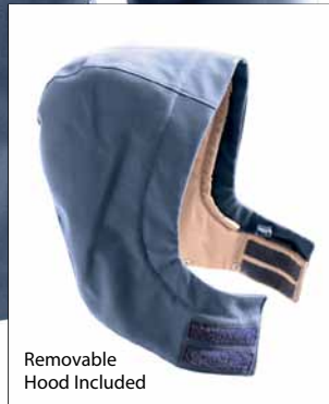
Removable Hood Included